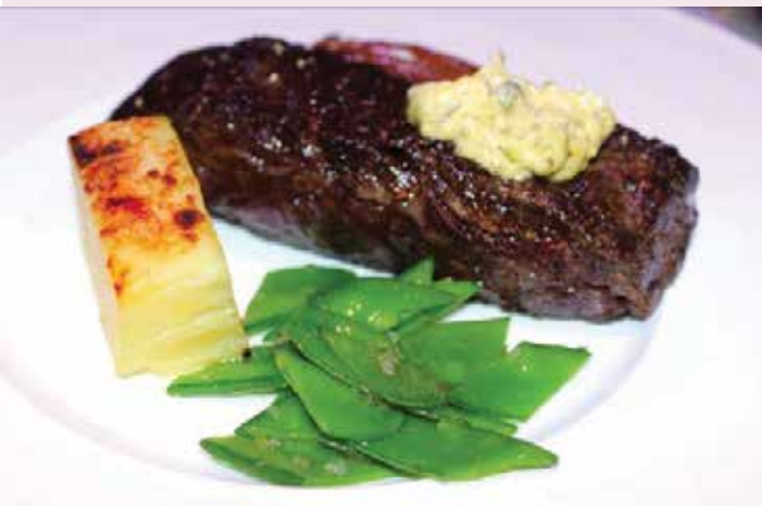
8-ounce ribeye cap from Snake River Farms with Potato Au Gratin and snap peas

Sports fans may gravitate to Hendo's Barrel House, where a buffet from 10 a.m. to 3 p.m. ($60 for adults, $19.99 for children) includes brunch staples, a crepe station, and a prime rib carving station.