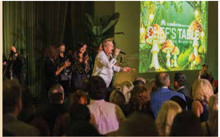
Mark McGrath from Sugar Ray entertains the crowd